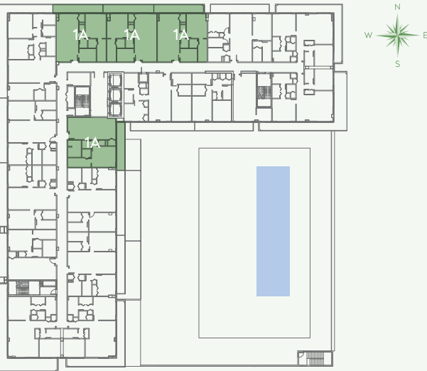
Key Plan of floors 9 & 10.